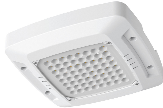
90 Degree Angle