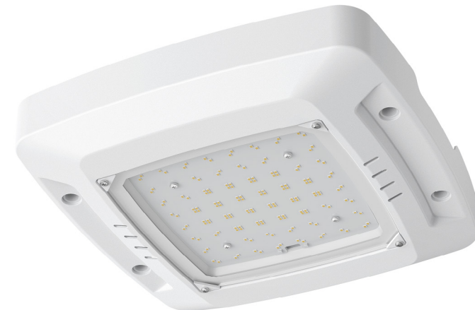
120 Degree Angle